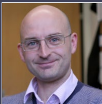
Camillo De Lellis