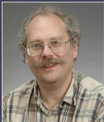
Peter Shor MIT